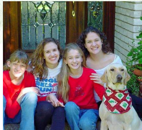
We had quite a few family pets growing up. I love dogs!