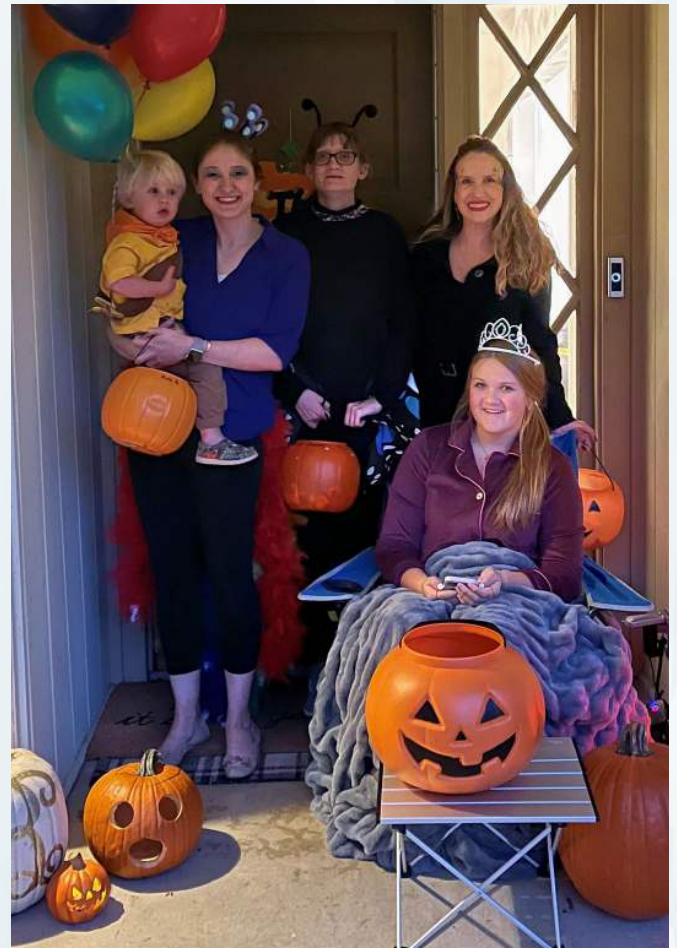
Halloween 2023 with my fam