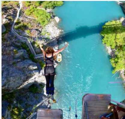
Bunjee in New Zealand