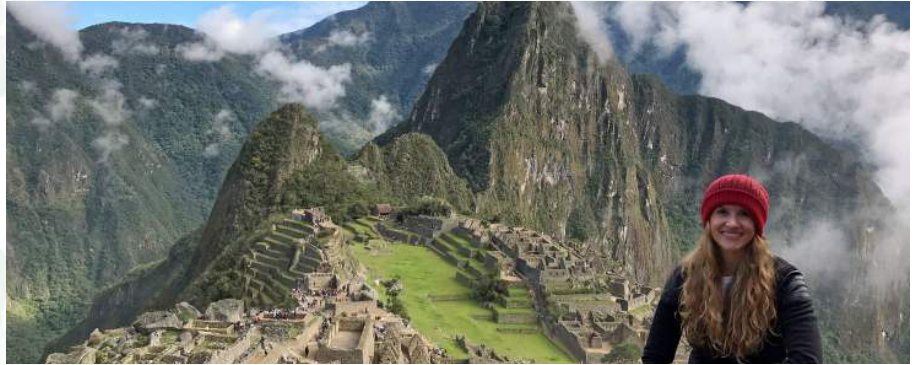
Machu Pichu, Peru