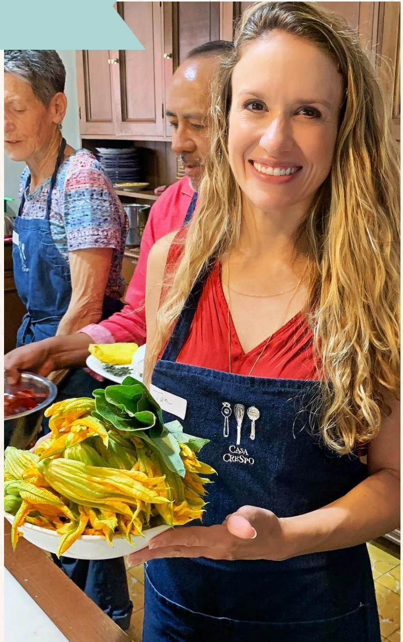
Cooking class in Oaxaca, Mexico

I look forward to nurturing my child's own interests and involving them in volunteer opportunities so they grow up understanding the importance of giving back to the community.