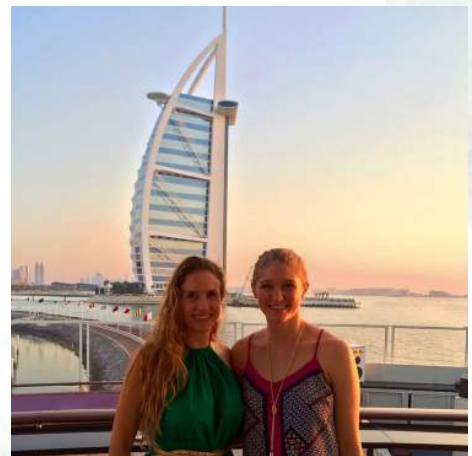
My sis visiting me in Dubai