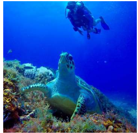
Scuba in Mexico