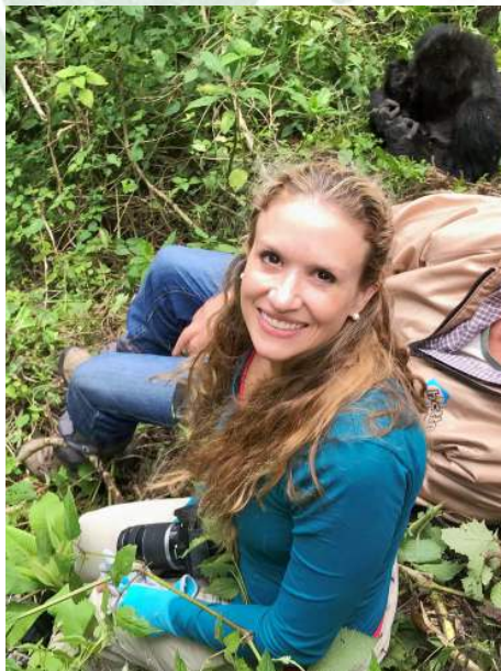
Gorilla trekking in Rwanda