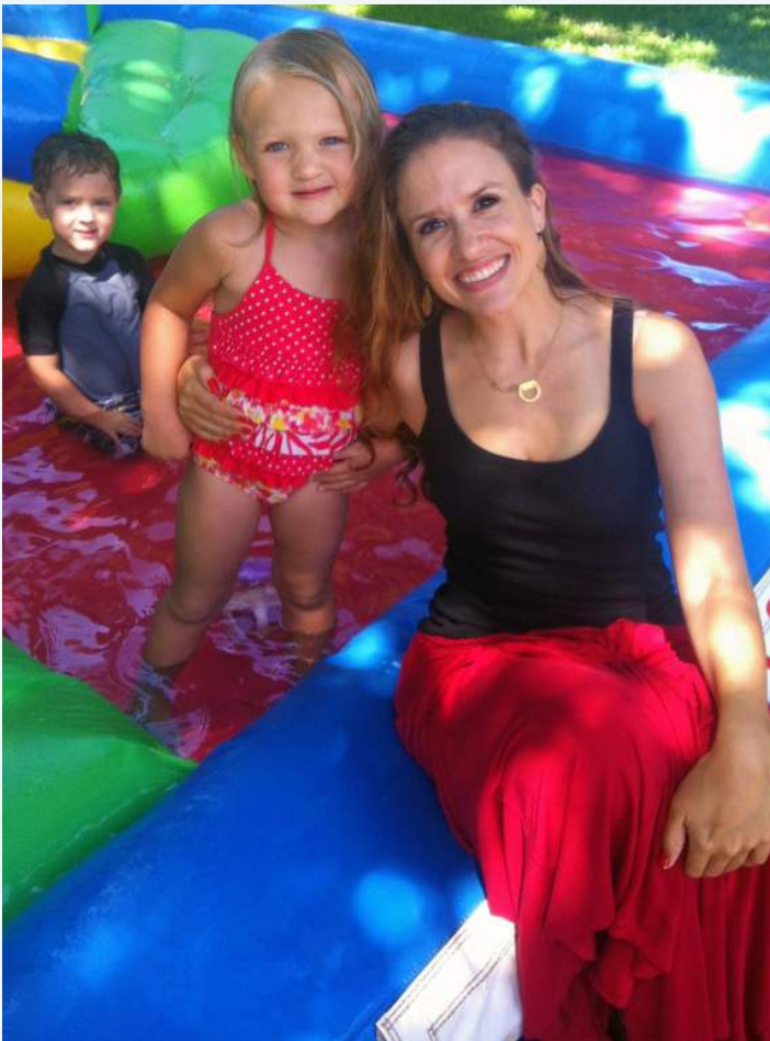
My niece's birthday party

I never miss a chance to decorate, dress up and celebrate the ones I love. I can't wait to plan birthday parties, make cute Halloween costumes, trick-or-treat as a family, dye eggs, hang Christmas stockings, look at lights together and gather around the table for Thanksgiving.