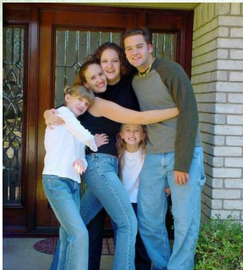
All my siblings