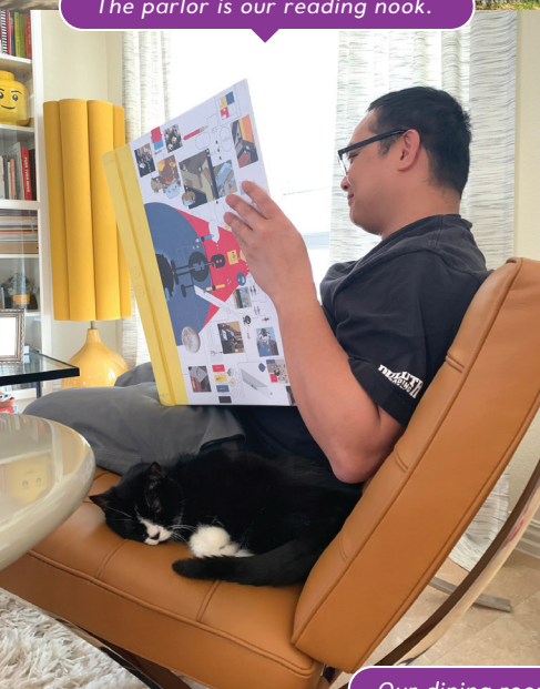
The parlor is our reading nook.

We also live right around the corner from our neighborhood park; which has a playground, basketball court, and pool.