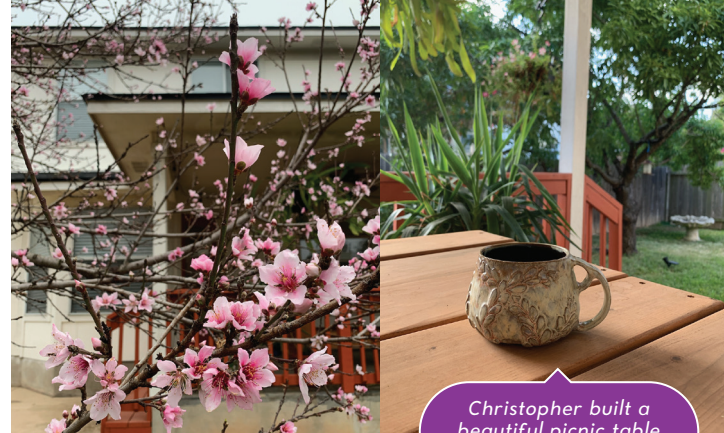
Christopher built a beautiful picnic table for the back porch.