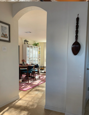
Our dining room decorated for Mothers Day Brunch.