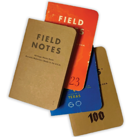
I write down all of my creative ideas. I've logged over 154 notebooks!