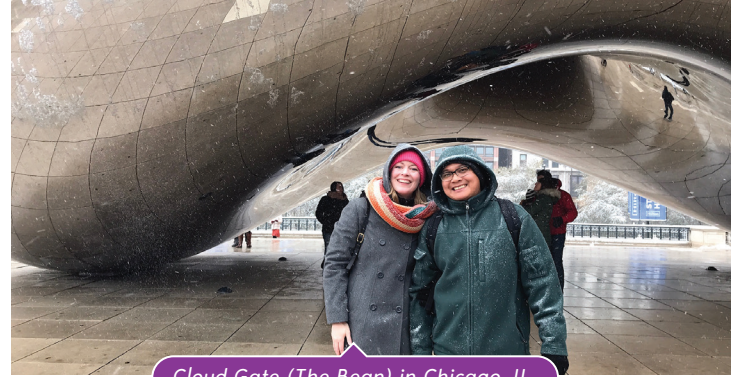
Cloud Gate (The Bean) in Chicago, IL.