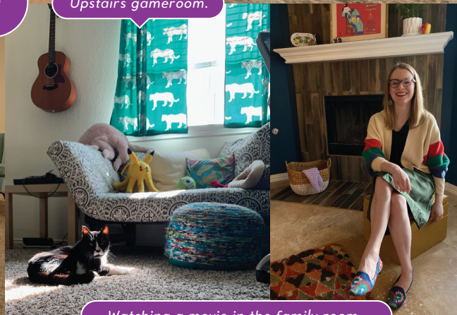
Watching a movie in the family room.