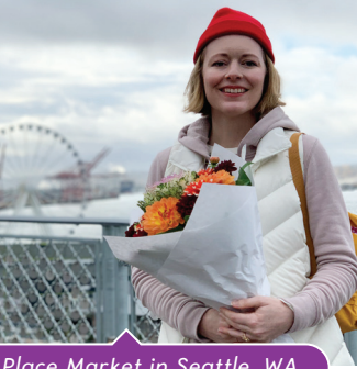
Pike Place Market in Seattle, WA.