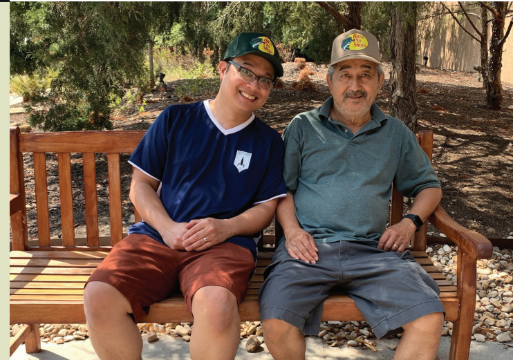
Me and my Dad.